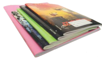
Staple Pin Exercise Notebooks