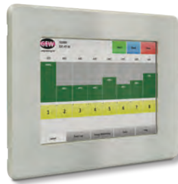
RHINO touch panel