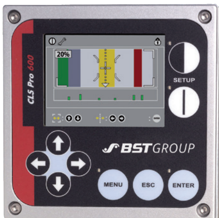
A color display of contrast transitions allows convenient selection of the desired printed line, print or web edge