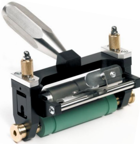
Esiproof Spring version