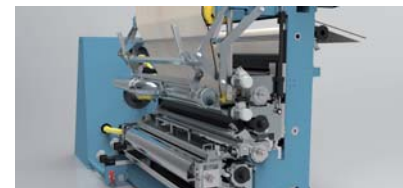
Fixed mounted coating station 800, 5 rollers for solventfree siliconizing