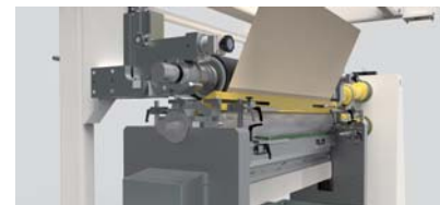
Coating station and Trolley 800 A for MPG 600 CI

Additionally, the versions 800 and 800 A offer the possibility of sleeve change, for instance when changing the working width. The sleeve can be changed without tools within a few minutes and without cutting the substrate.