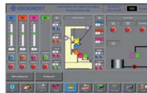
KROENERT ProLine screenshot silicone coating station