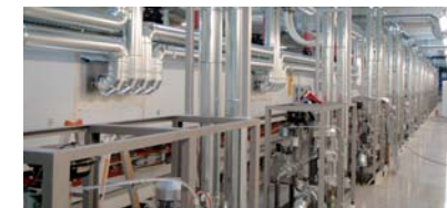
Energy-optimized drying tunnel

The competent and efficient KROENERT service is at disposal for maintenance, repair and if necessary for conversion of the line for adaption to changed requirements.