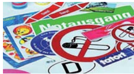
Pressure sensitive Labels