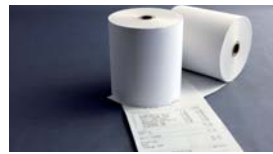
Thermal Printing Papers