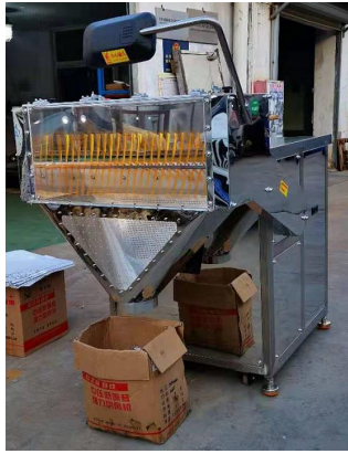
*Scatter machine (manual collecting)