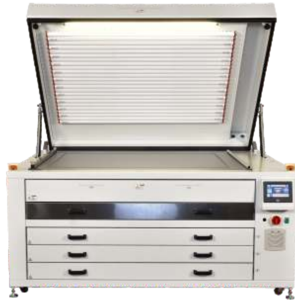
Plate making equipment for photopolymer plates up to a maximum size of 635 x 762 mm.