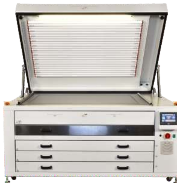
Plate making equipment for photopolymer plates up to a maximum size of 920 x 1200 mm.